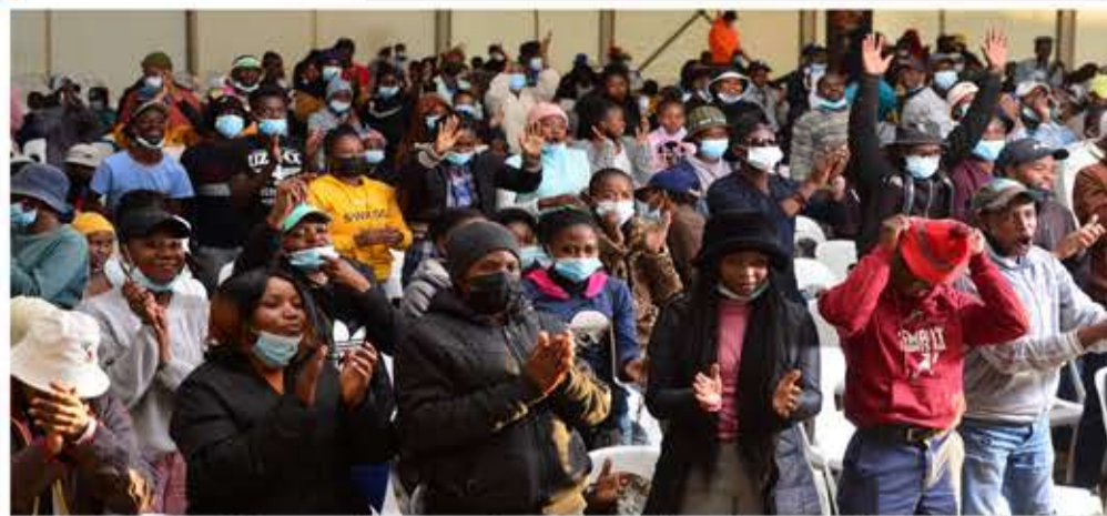
Thousands of Orange Farm youths attended the EmpowaYouth Week 2022 held at Chris Hani Sports Complex. Register today for this year's edition!

...This is why when he activates the EmpowaYouth events, they make sure they are done to gold standards – they bring it all to where the youth are at and tell them, through our actions, that they are being listened to and that they are worth it. For EmpowaYouth, the target market is two-fold – peri-urban and semi-rural township youth between the ages of 18-35 that desire to change their socio-economic circumstances; and the public and private entities that can offer the opportunities, whether they are jobs, skills development or entrepreneurial funding. EmpowaYouth is a platform – it's not an event. Yes, they activate events but there's so much more that happens after the event and by bringing different private and public enterprises on board, EmpowaYouth can ensure that they leave a legacy behind in each area they activate. EmpowaYouth brings information and real and relevant opportunities to youth where they are – the platform partners with relevant private and public enterprises to ensure that the job, learning and funding opportunities are indeed relevant to the youth. They bring expert speakers to outline the different career streams and entrepreneurial gaps in various industry sectors so that the youth can understand where they can fit in and what resonates with their personal dreams and skillsets. There are a number of young people in