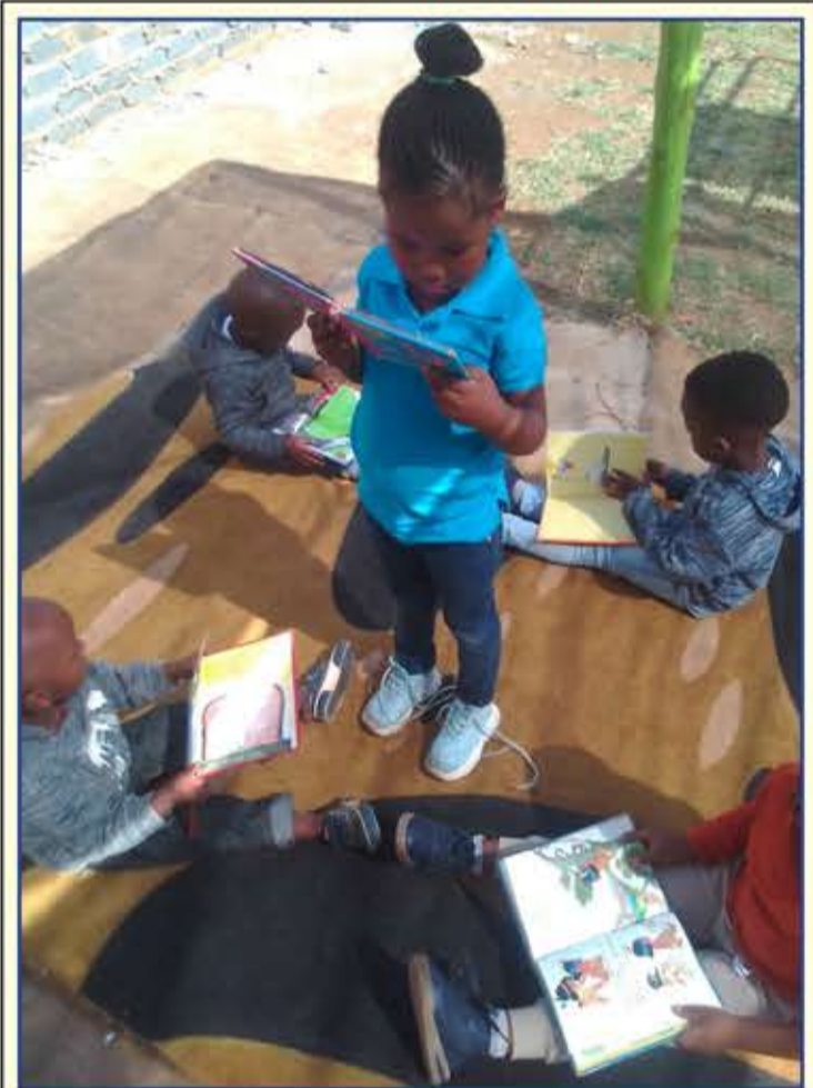
CATCH THEM YOUNG: Lusemanzi ECD learners are taught to love reading both at school and at home

To support the crew, contact Lebohlang Lehana on 084 702 0708.