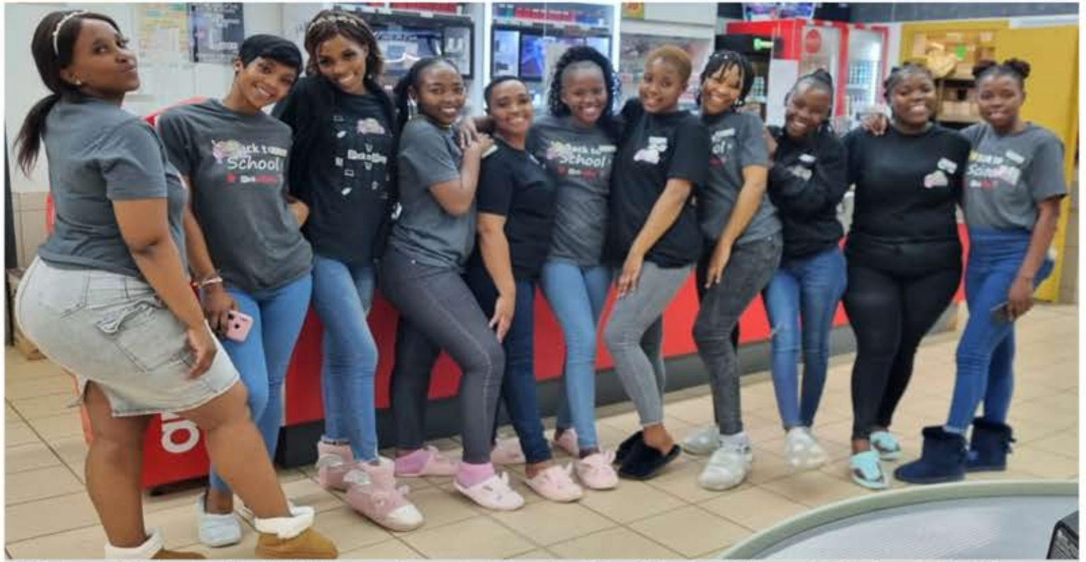
Workers at Pick n Pay Eyethu Mall wore slippers to help raise R10-million for children with life threatening illnesses