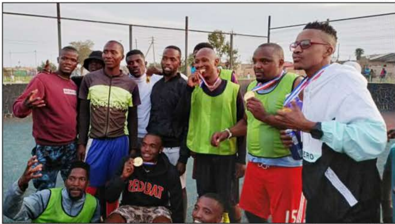
CELEBRATIONS: George FC players cheerful after their games at Old Park, Orange Farm Ext 6

George FC took home a R1 000 cash prize, trophy and medals after defeating Lost FC on penalties following a goal-less draw in the finals of the 5-a-side Top 8 Football Tournament at the Orange Farm Ext 6a Old Park on 1 May.